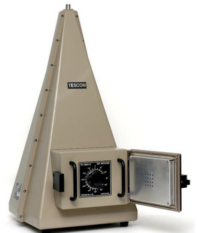
TC-5062A fitted with DUT Rotator